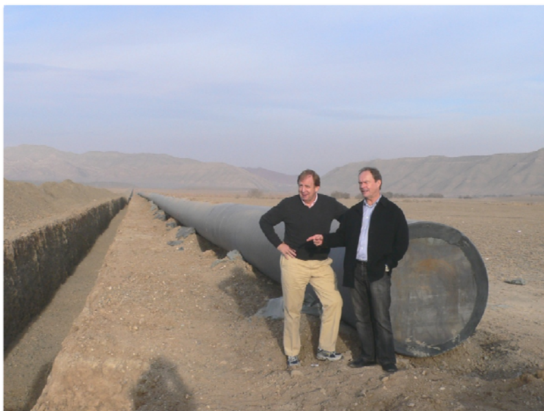
Second West-East Natural Gas Pipeline Crosses TWE's Liuhaunggou PSC Area

The main trunk route of China's second West-East Pipeline (WEP-2) has gone into operation, China National Petroleum Corp. (CNPC) has said.